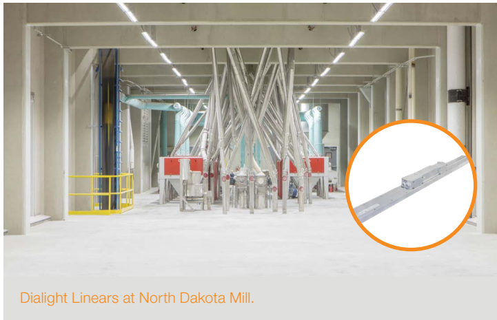
Dialight Linears at North Dakota Mill.

“With so many overhead structures, we sometimes have to do some unique things with our lighting in order to get the light where we need it,” Lemoine said. “We had already begun changing out from high-pressure sodium and mercury vapor to LED fixtures throughout the facility, and we knew we needed classified fixtures that would safeguard against the risk of combustion or explosion due to dust inside the facility,” Lemoine said.