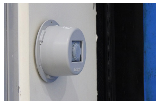
Dialight occupancy sensor installed at PepsiCo.