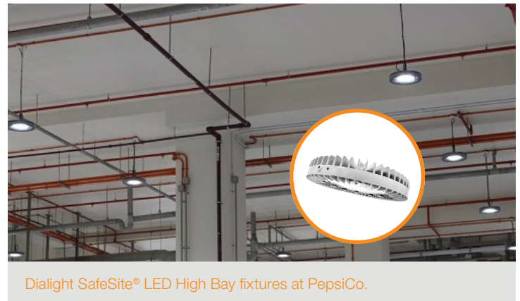
Dialight SafeSite® LED High Bay fixtures at PepsiCo.

Dialight was able to deliver a fast turnaround on this project so PepsiCo's was able to start seeing energy benefits sooner.