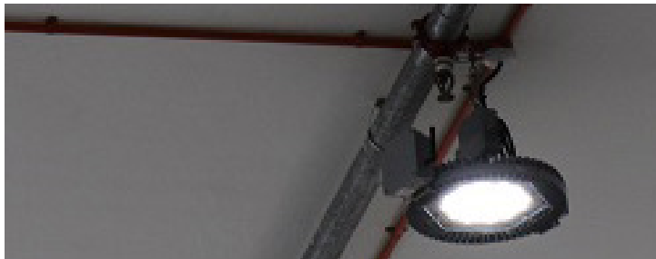
Dialight Vigilant® LED High Bay fixture at PepsiCo.

"Dialight's LED solution gives us with flexibility with lighting schedules and future integration of lights into our digital platforms, while Dialight's 10-year warranty also gives us confidence in the reliability of the products moving forward."