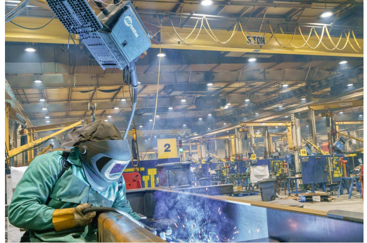
Dialight High Bays provide employees with a brighter, safer work environment.

Couch estimates that each fixture took only about 15 minutes each and one electrician was able to swap out a 50x50-foot bay in about 40 minutes.