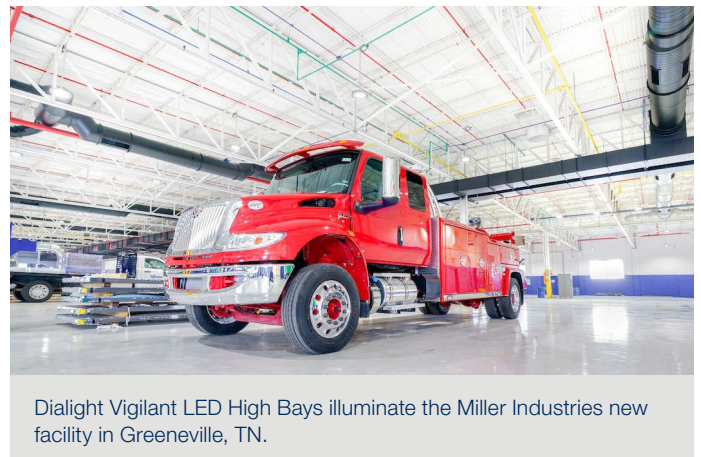
Dialight Vigilant LED High Bays illuminate the Miller Industries new facility in Greeneville, TN.

What began with a trial of just four Dialight 18,000 lumen Vigilant High Bay fixtures soon transformed into a complete corporate retrofit across all Miller Industries' facilities. With the completion of the project at Greeneville, Miller's US facilities are now 100% converted to Dialight's class-leading Vigilant industrial LED High Bay fixtures and are now fully realizing the benefits of higher quality, more sustainable and maintenance-free lighting.