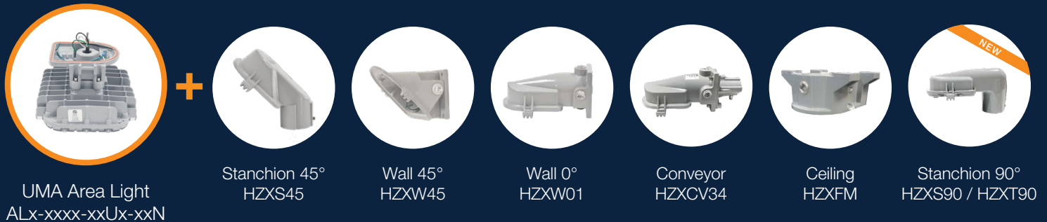
UMA Area Light ALx-xxxx-xxUx-xxN