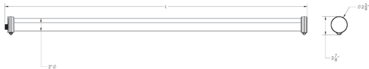
Dimensions in inches [mm]