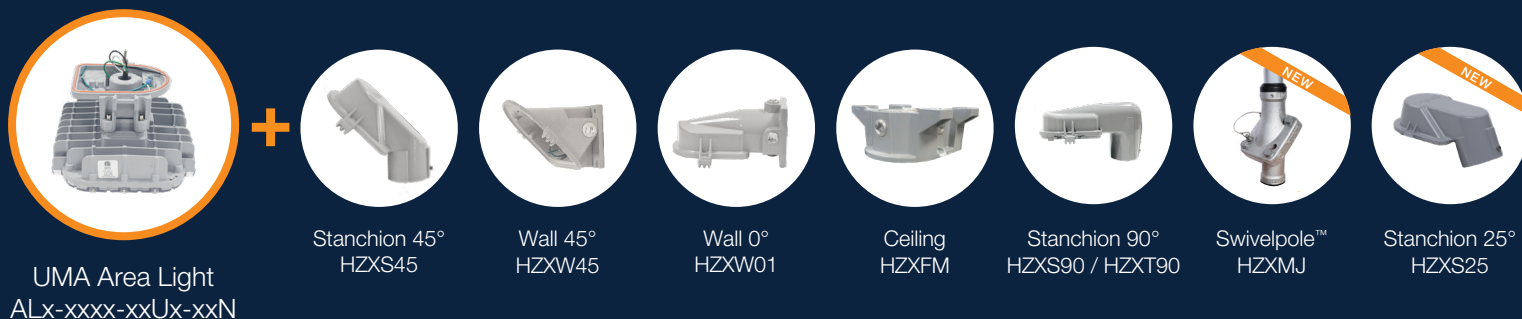
UMA Area Light